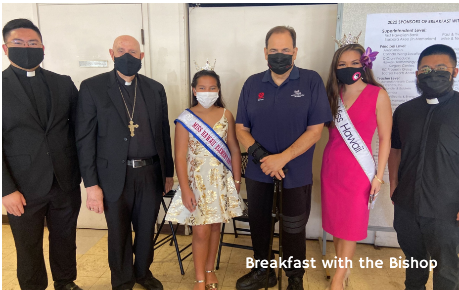
Breakfast with the Bishop

920 KEOLU DRIVE, KAILUA, HI 96734 | 808-262-8317